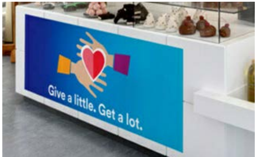
3M IJ56C is an Ultra Removable Film for Flat & Slightly Curved Surfaces.