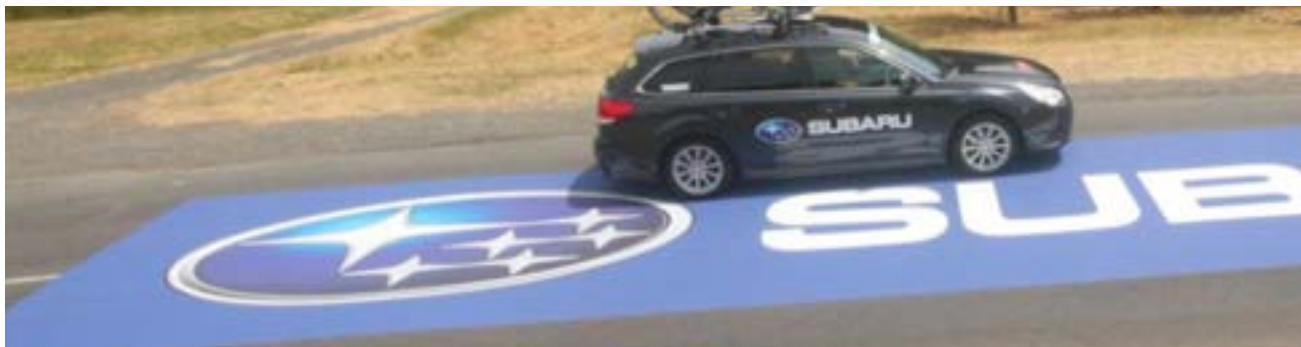
FoilWalk is Made for Pavement Applications.