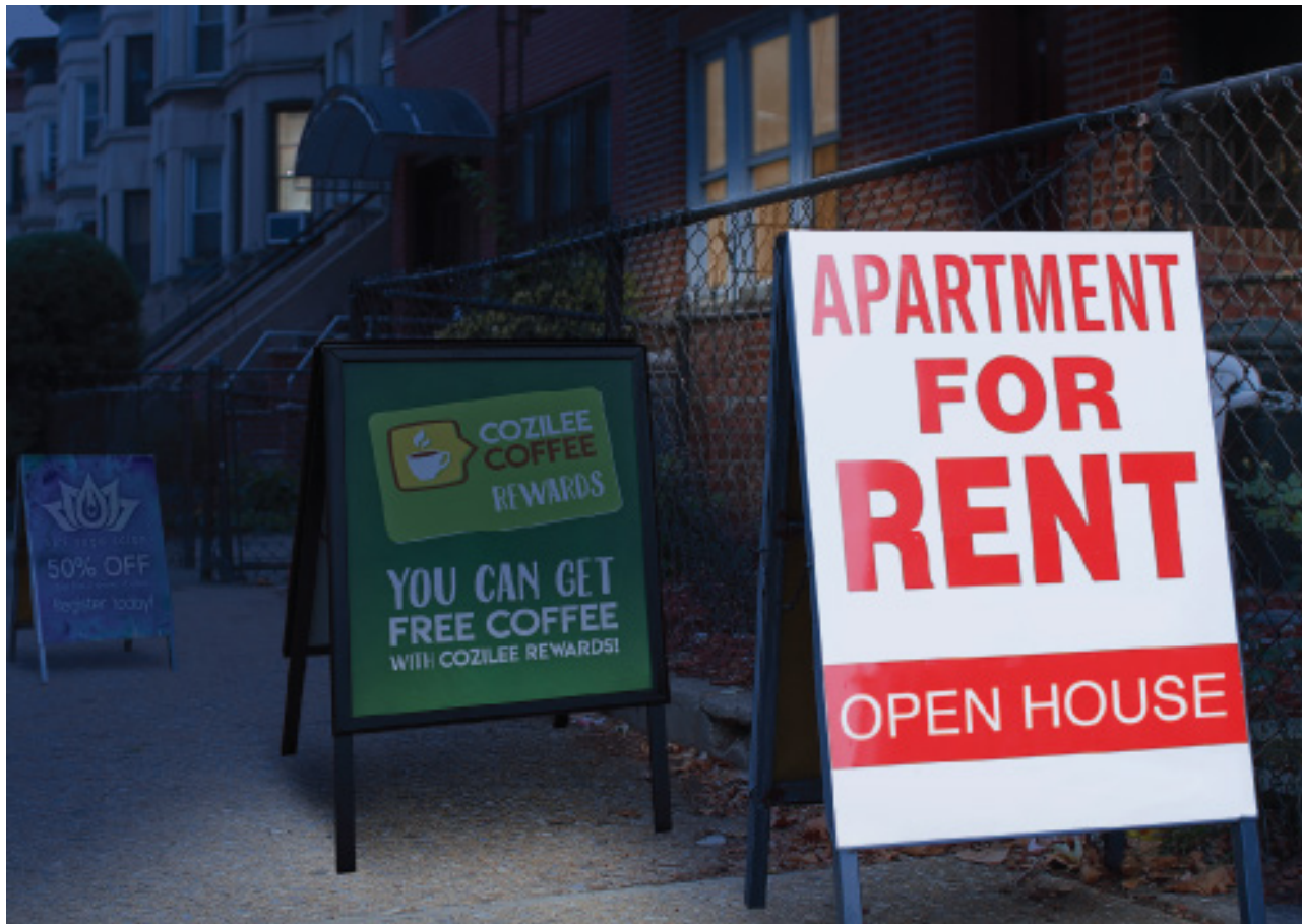
7310 is Bright White, Day & Night